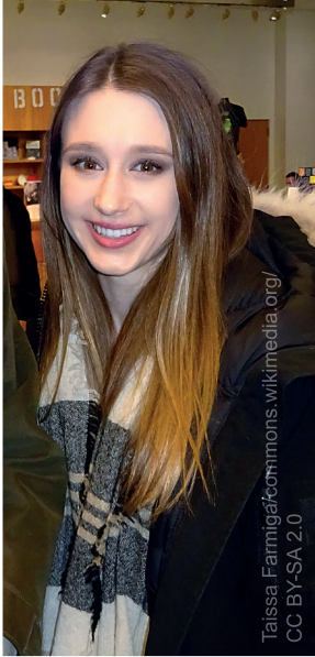
Taissa Farmiga/commons.wikimedia.org/ CC BY-SA 2.0